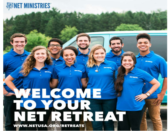
Youth Ministers from the NET team

Los estudiantes de High School y Junior High School están invitados a unirse a un retiro de NET el 29 de noviembre de 2020. Estos retiros son llevados a cabo por un equipo de jóvenes ministros de jóvenes para los grados 7-12. Estos retiros son experiencias de alta energía utilizando presentaciones grupales, discusión en grupo, música, drama, intercambio de fe personal, oración única y los sacramentos de la Reconciliación y la Santa Eucaristía.